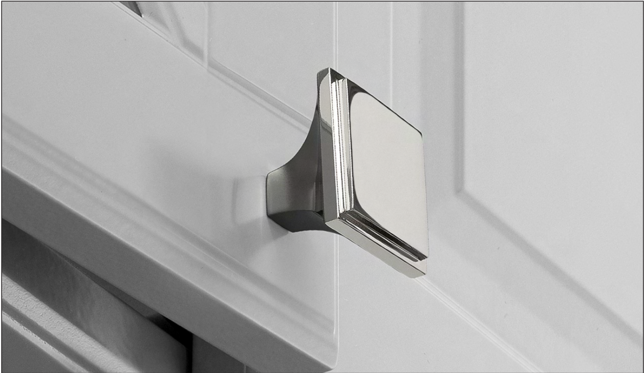
Polished Nickel (Finish ID : 8)