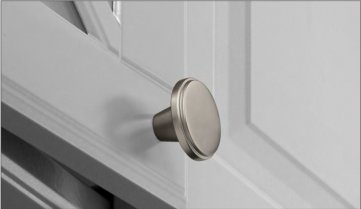
Brush Nickel (Finish ID : 3)