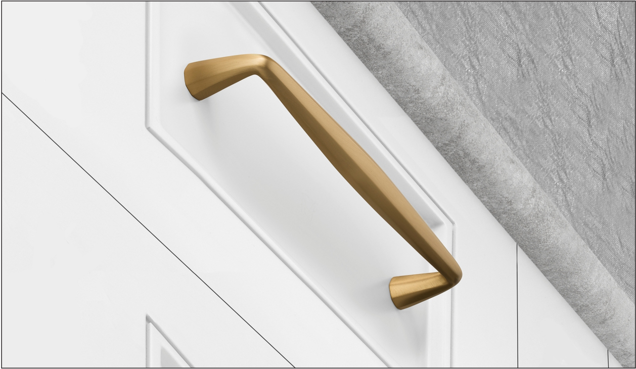
Satin Brass (Finish ID : 13)