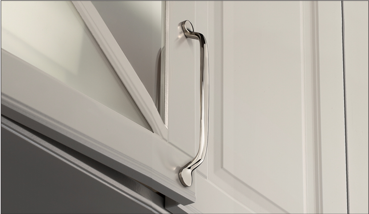
Polished Nickel (Finish ID : 8)