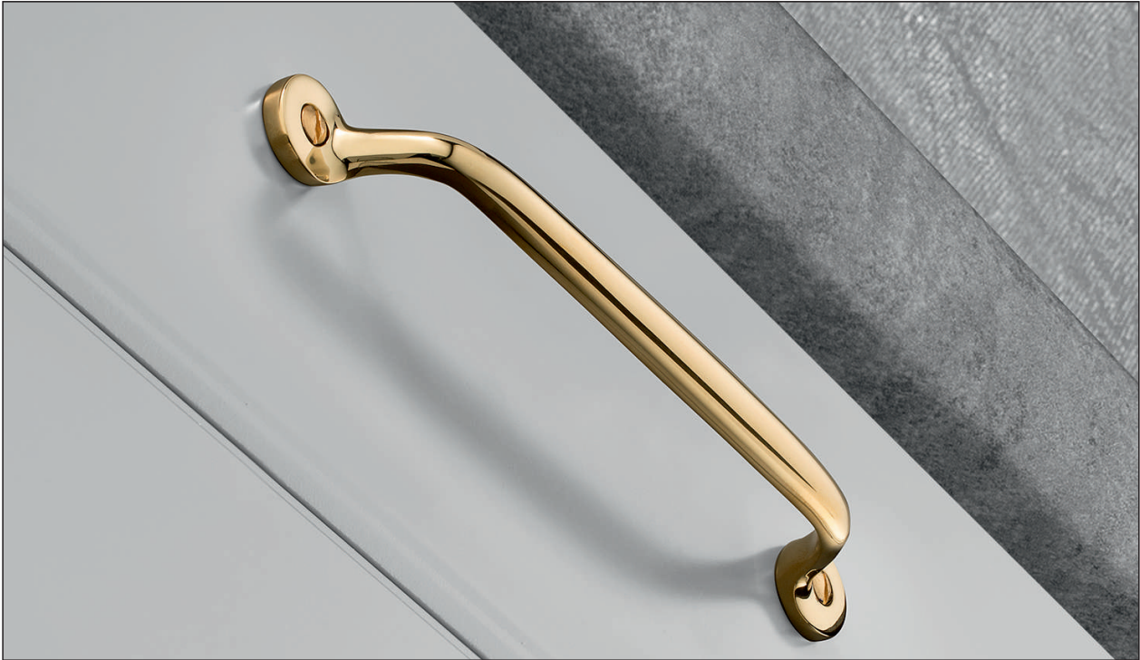
Unlacquered Polished Brass (Finish ID : 7U)