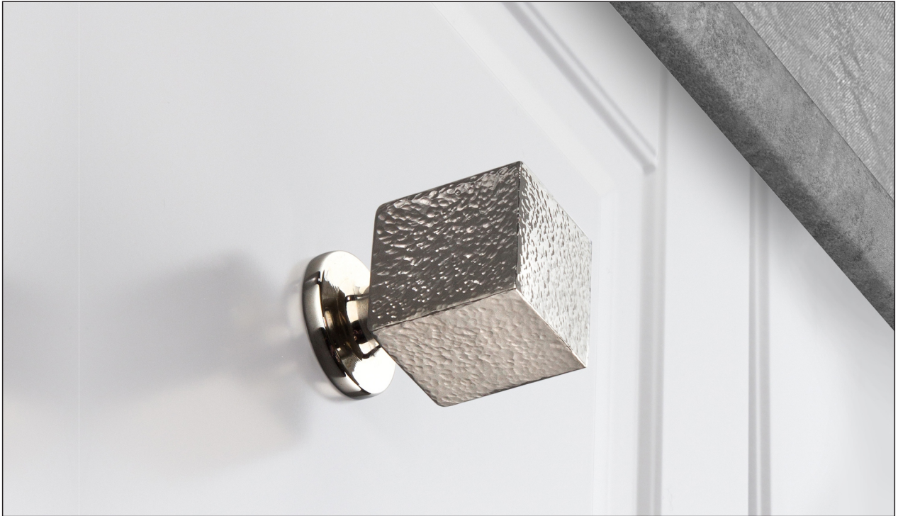
Hammered Over Polished Nickel (Finish ID:12-8)