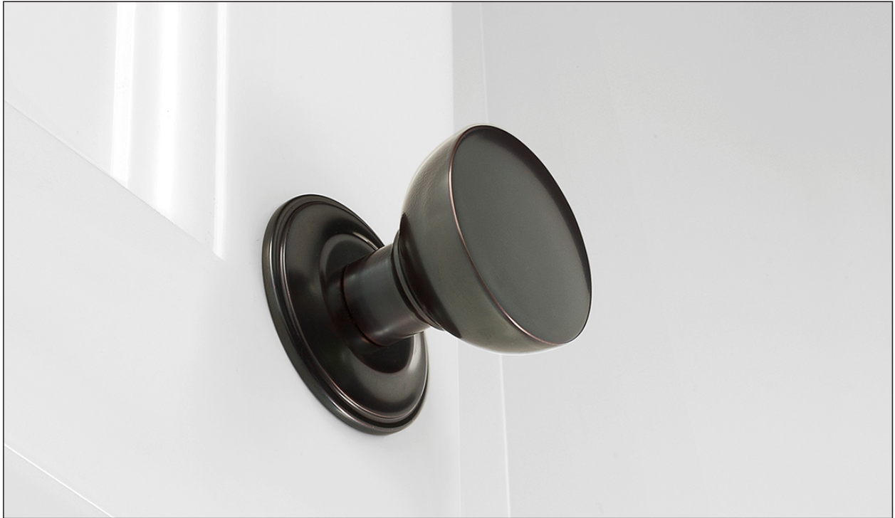
Oil Rubbed Bronze (Finish ID : 5)