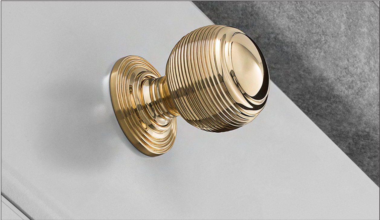
Unlacquered Polished Brass (Finish ID : 7U)