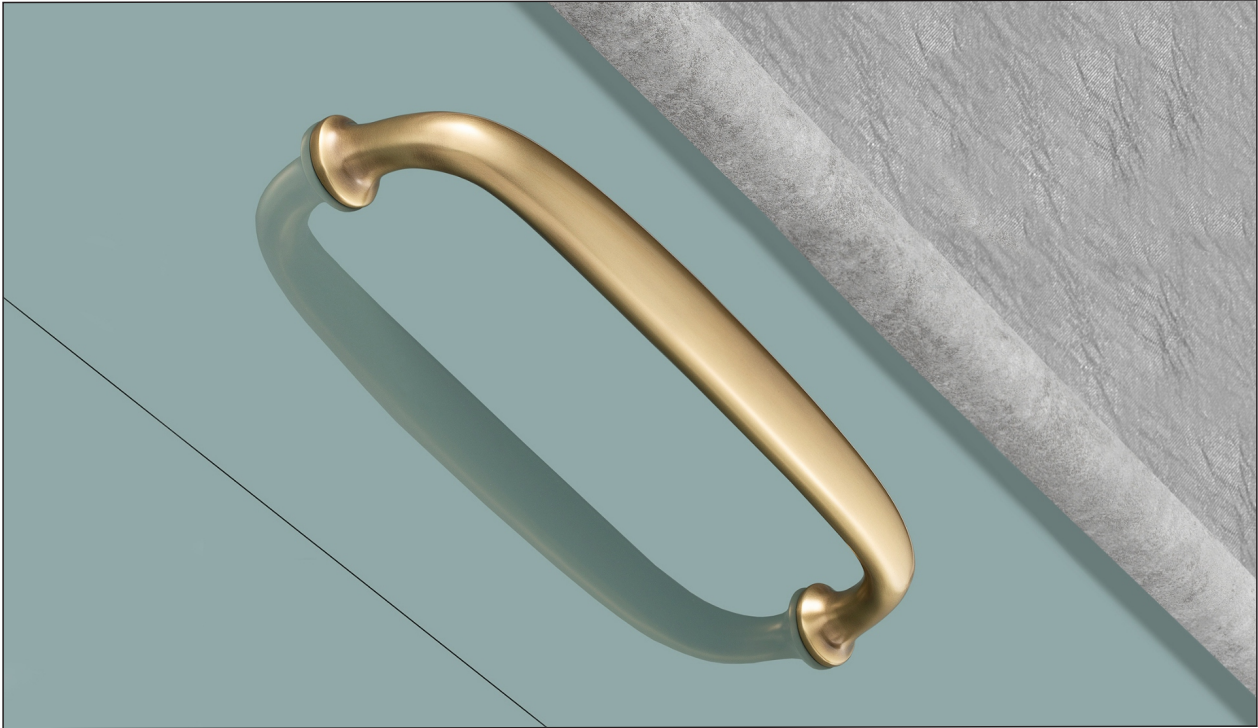
Aged Brass (Finish ID : 4)