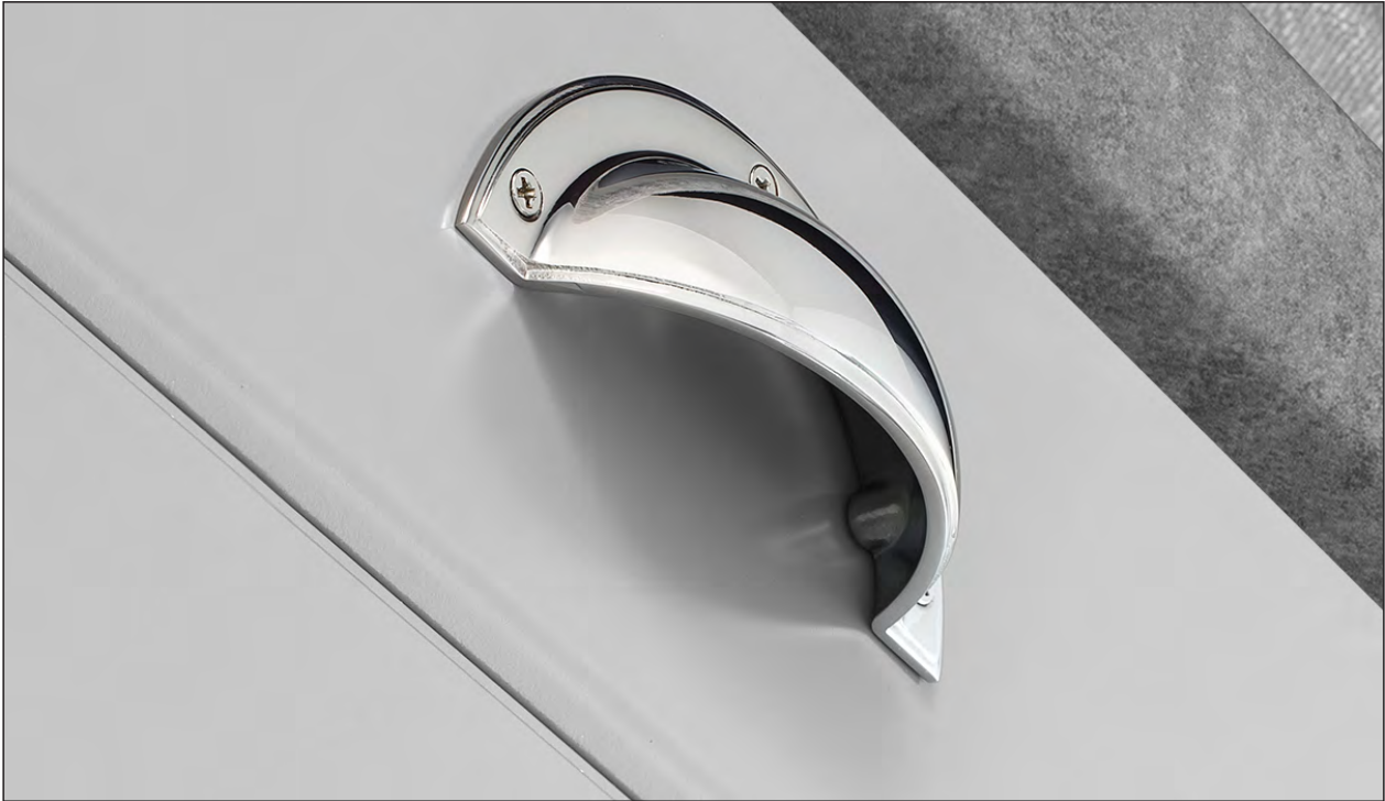
Bright Chrome (Finish ID : 2)