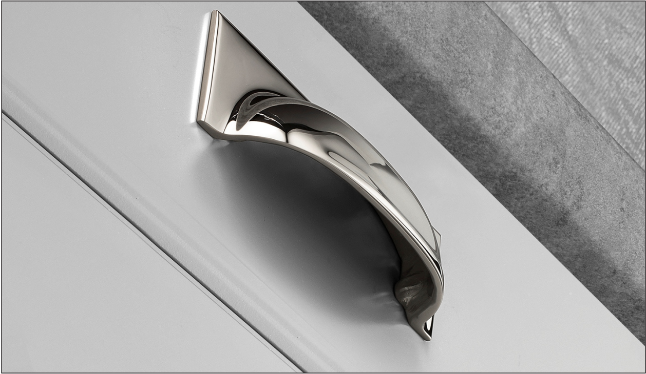
Polished Nickel (Finish ID : 8)