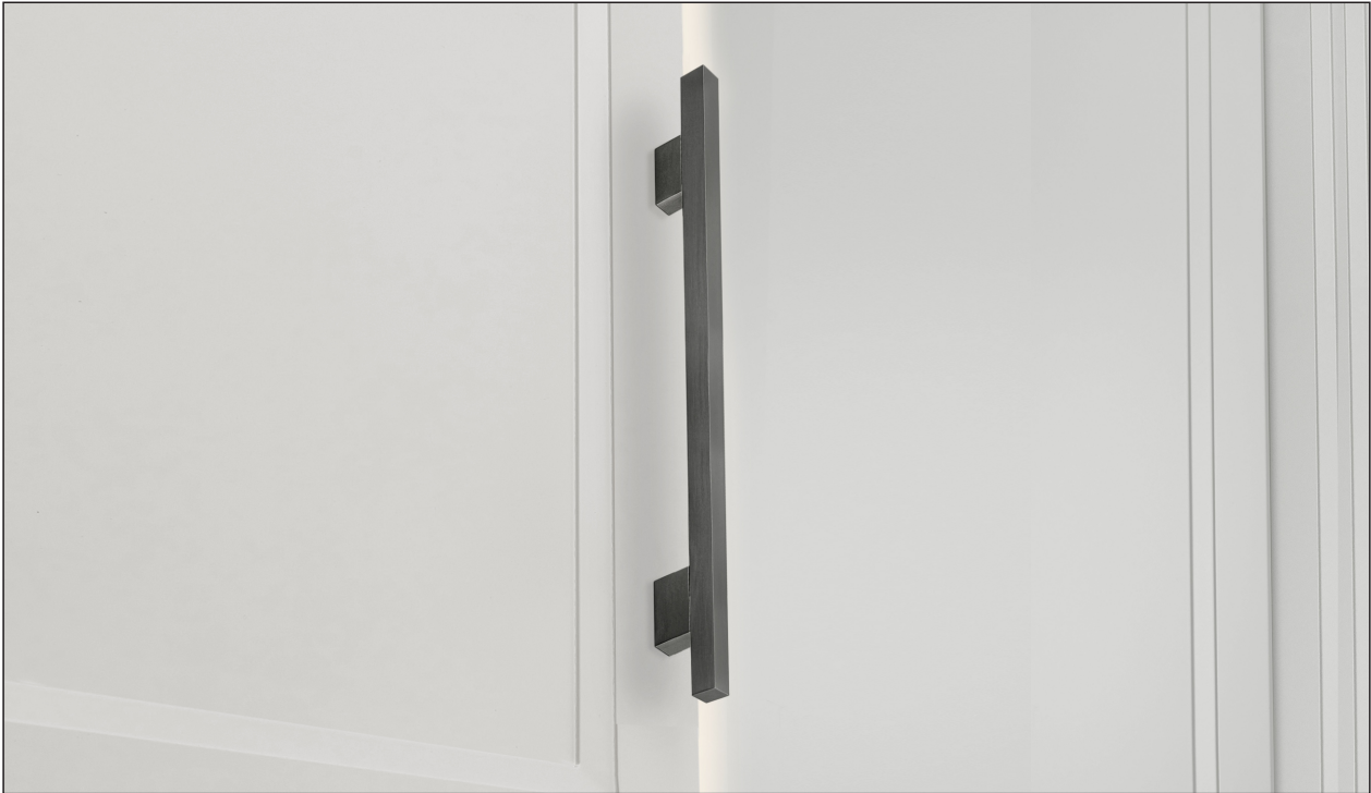
Graphite (Finish ID:61)