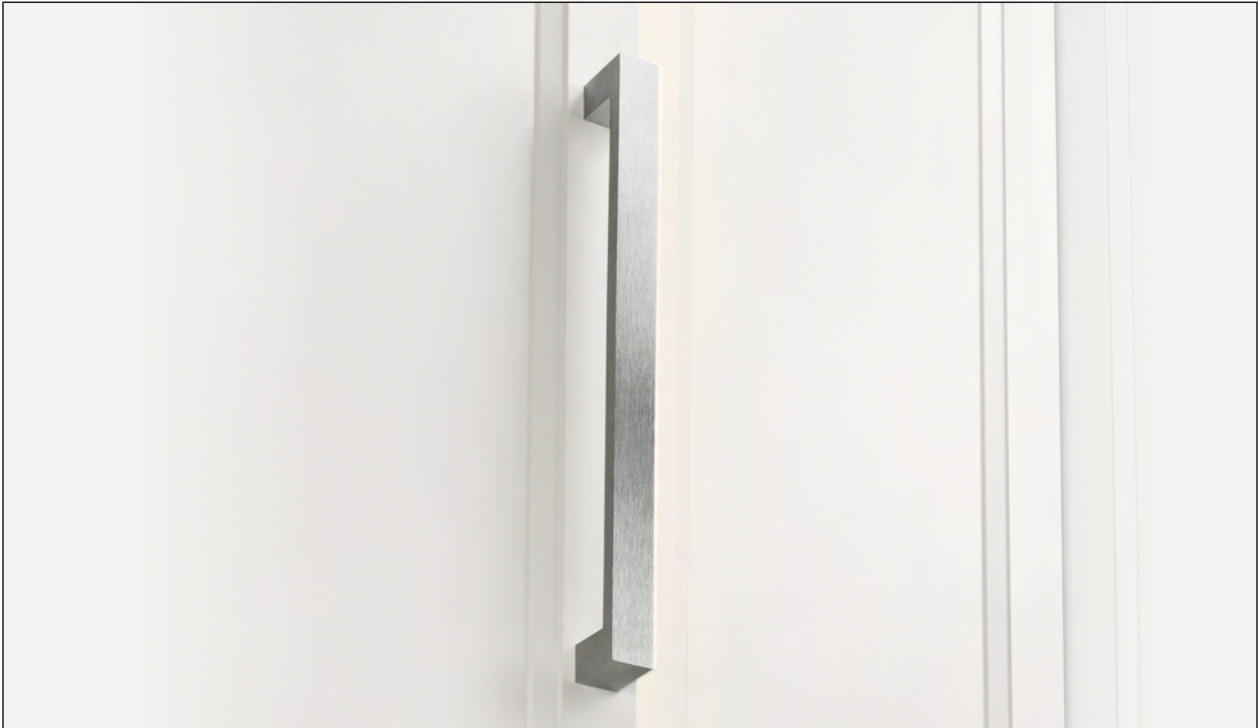
Satin Chrome (Finish ID:24)